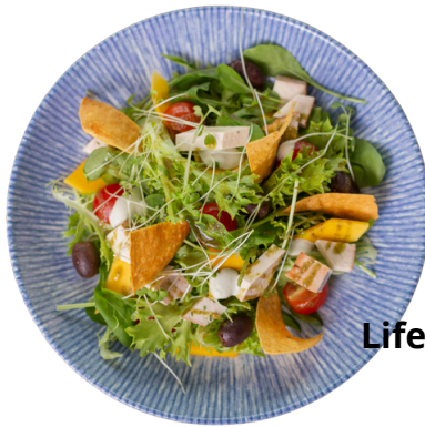
Lifestyle & Wellness

Our daily habits have a direct impact on the health of our cells and, therefore, on our fertility. Living a healthy lifestyle can enhance the results of your surrogacy treatment. From home, you can adopt small actions that make a big difference. Here are some key habits to support you along the way.